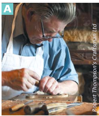
Robert Thompson's Craftsman Ltd