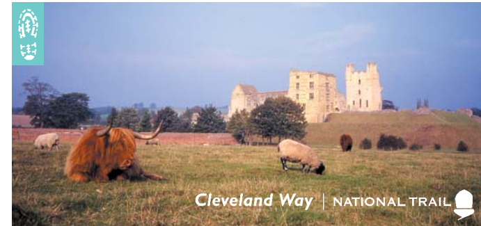
Cleveland Way | NATIONAL TRAIL

The charming Shandy Hall was home to author Laurence Sterne, one of the most celebrated authors of the 18th century who wrote the novel The Life and Opinions of Tristram Shandy . The house is now a museum housing a collection of his books and papers with many of the rooms restored to look as they would have done during Sterne's time there. Nearby is St Michael's Church where Sterne was a parson. One of Yorkshire's first churches, St Michael's is believed to have been built on the site of a pagan temple.